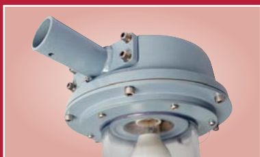
/SE Spigot mount version